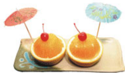
9. Mandarin Orange $2.75

Is this your Birthday Week? Ask us about the FREE Birthday Wheel of Fortune.