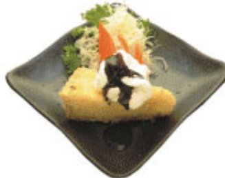
5. Tempura Cheese Cake $4.25