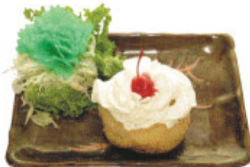
4. Fried Ice Cream Tempura Battered and fried rich ice cream $4.95