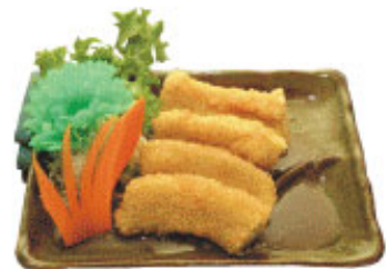
6. Banana Tempura Ripe bananas lightly battered and deep fried w/sweet sauce $4.25