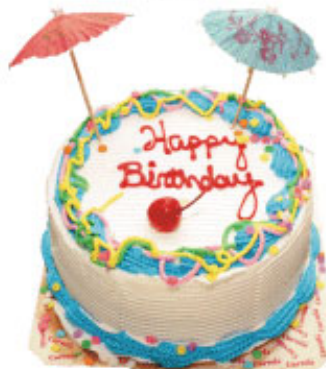
8. Birthday Ice Cream Cake Complete w/picture & gift serves 2 to 12 people $19.95