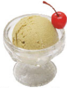
3. Green Tea Ice Cream $2.99