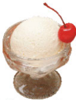
1. Vanilla Ice Cream $2.99