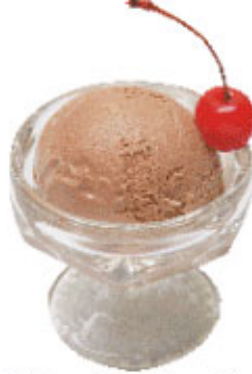
2. Chocolate Ice Cream $2.99