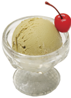
1. House Ice Cream (Green Tea, Vanilla, Chocolate) $3.99