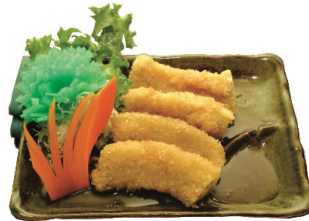
5. Banana Tempura Ripe bananas lightly battered and deep fried w/sweet sauce $5.25