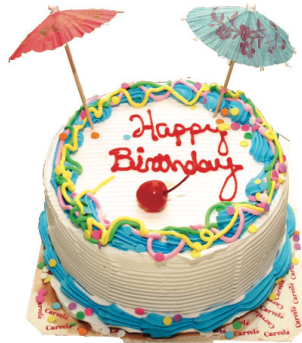
7. Birthday Ice Cream Cake Complete w/picture & gift serves 2 to 12 people $28.95

If this is the week of your Birthday, You will receive a Gift. Ask us about the Birthday Wheel of Fortune.