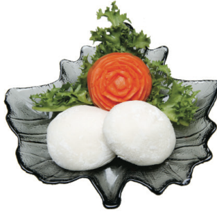
2. Mochi Ice Cream $4.50