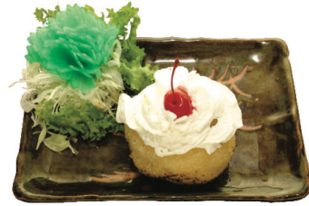
3. Fried Ice Cream Tempura Battered and fried rich ice cream $5.95