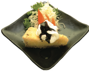
4. Tempura Cheese Cake $5.25